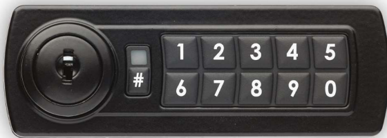
Product ID: 3700